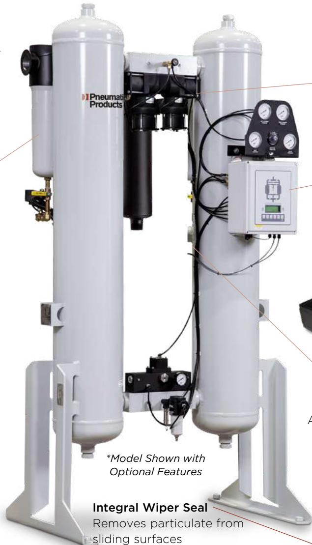
*Model Shown with Optional Features