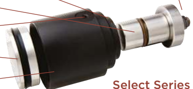
Select Series Poppet Valve Sectional